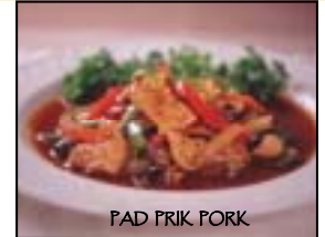
PAD PRIK FORK