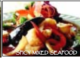
SPICY MIXED SEAFOOD