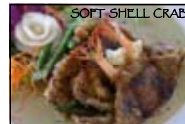
SOFT SHELL CRAB