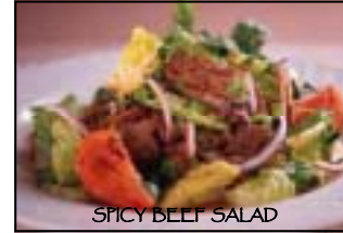
SPICY BEEF SALAD

CHAR-GRILLED MARINATED STRIPS OF LEAN BEEF, TOMATO, RED ONION, & CUCUMBER IN A SPICY SURIN SAUCE WITH ROMAINE LETTUCE. $9