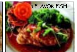
3 FLAVOR FISH

AUTOMATIC 18% GRATUITY FOR PARTIES OF 6 OR MORE PLATE SHARING: $2 (PER PERSON) BROWN BAG CORKAGE FEE $10 THIS MENU IS COPYRIGHTED. VISIT US AT: WWW.SURINOFTHAILAND.COM