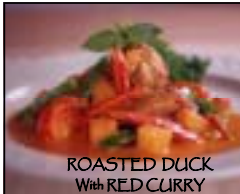
ROASTED DUCK With RED CURRY

THREE BONELESS CATFISH FILETS, FRIED TO A SUCCULENT TENDER AND SERVED WITH A THAI GINGER SOY SAUCE ON ROMAINE LETTUCE.