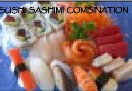
SUSHI SASHIMI COMBINATION