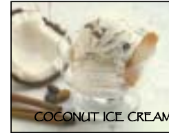
COCONUT ICE CREAM

RED CURRY PASTE SAUTÉED WITH COCONUT MILK, BELL PEPPERS, CHICKEN BREAST AND BASIL LEAVES. SHRIMP $14